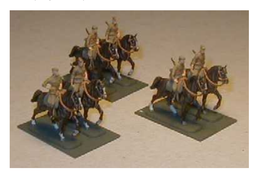
I used 3 different figures from the Revell artillery set - the officer and two of the figures meant for the horsedrawn limber.

Lacking any specific information on the Hungarians I went for this, since being my first Hungarian cavalry figures, my hussars must be the senior ones!